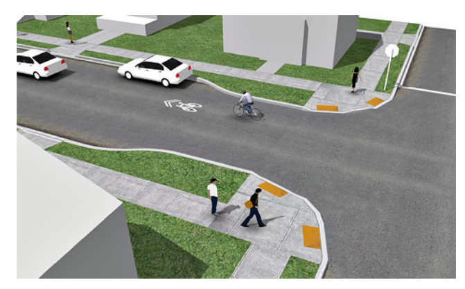
Figure 1: Example Curb Extension/Bulb-Out

Traffic Calming Devices are widely used across the nation to help reduce reckless driving as well as ensuring the public's safety. The City of Lowell has a variety of options to enforce speed reductions. These devices include, but are not limited to speed bumps, humps, and tables, chicanes and chokers, corner extensions/bulb-outs, digital radar speed signs, and narrowing of the road.