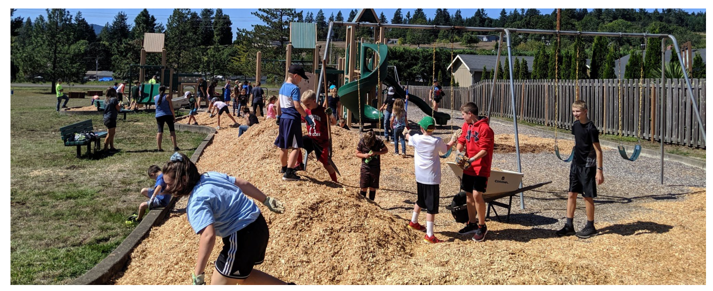
Figure 8: Mountain View Academy "Embrace the Community Day" at Paul Fisher Park.