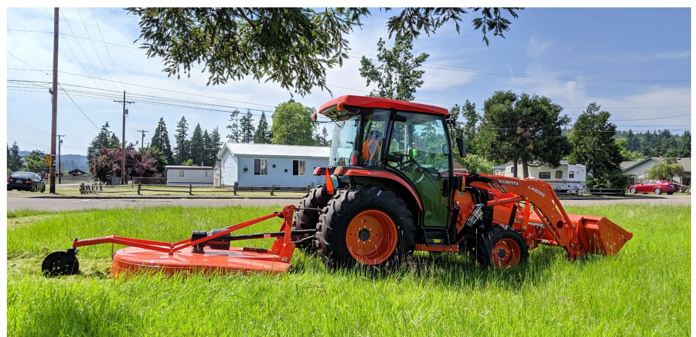
Figure 9: Tractor purchased in 2019 for streets, parks, green waste and sewer plant maintenance.