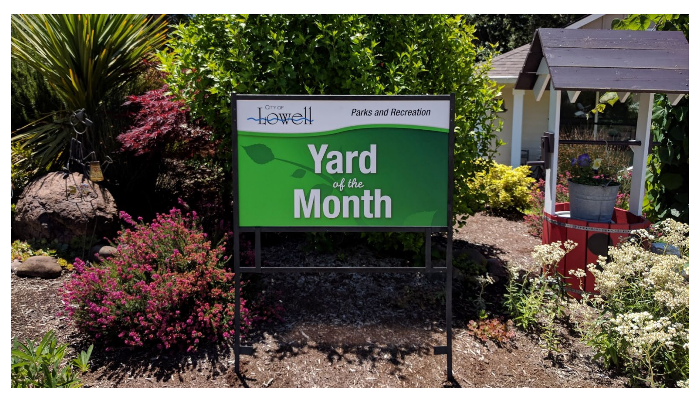
Figure 13: First Yard of the Month Award to Monica Thompson at 92 Wetleau Drive.