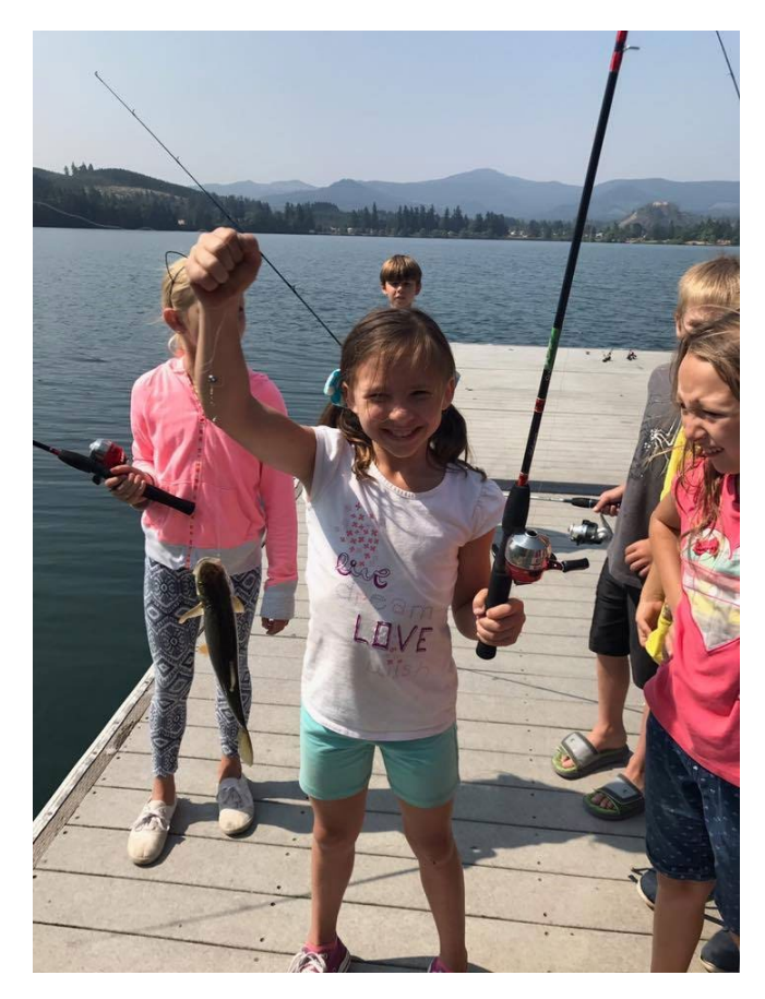
Figure 3: Lowell School District Summer Recreation Program at the Oregon Association of Rowers dock. The program is supported by the Lowell Parks and Recreation Department.

These represent a set of initiatives, actions, or performance measures, which are designed to support the objectives. Work plans are implemented, tracked, and staff submits a quarterly status report to the City Council. Work plan initiatives are revised and prioritized by year to advance the objectives.