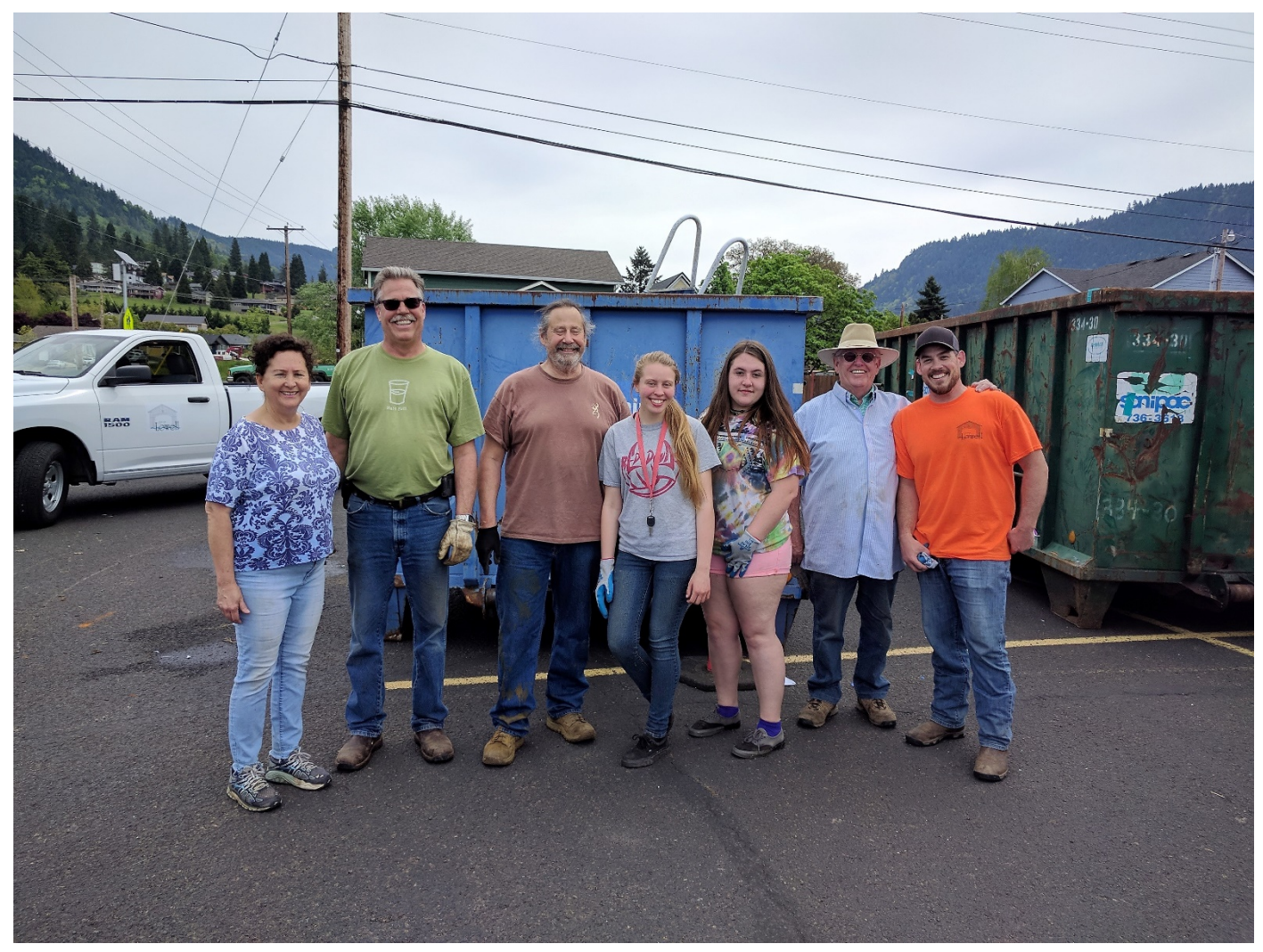
Figure 14: Lowell Beautification Day volunteers.