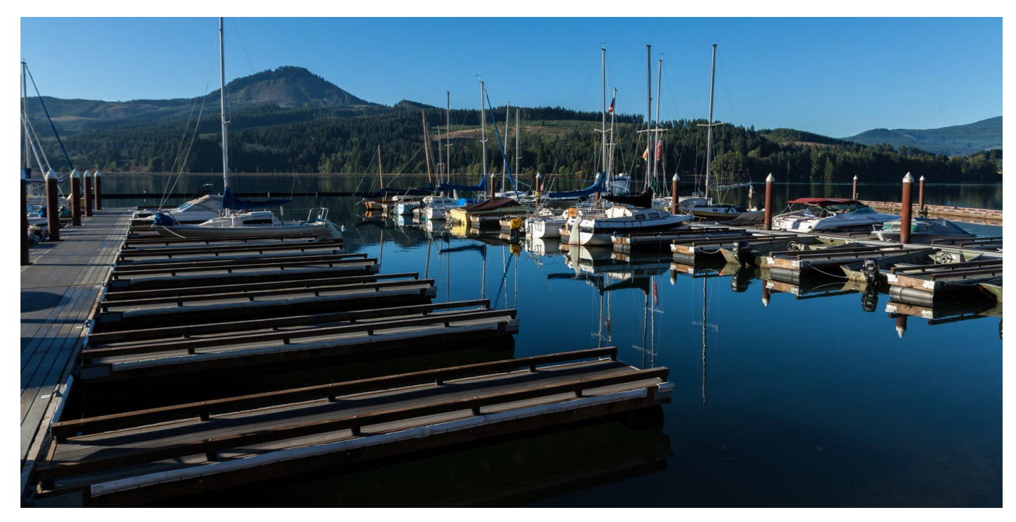
Figure 2: Lowell State Park Marina

Several objectives are identified under each goal. The objectives refine the goals into broad action areas that support each goal.