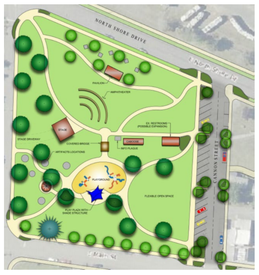
Figure 11: Rolling Rock Park and Cannon Street Festival Area Conceptual Plans