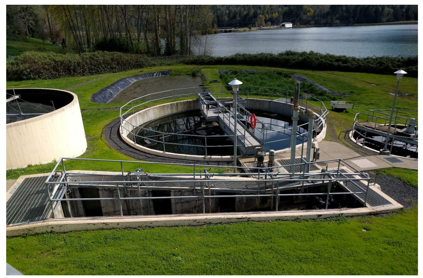
Figure 10: Lowell Sewer Treatment Plant