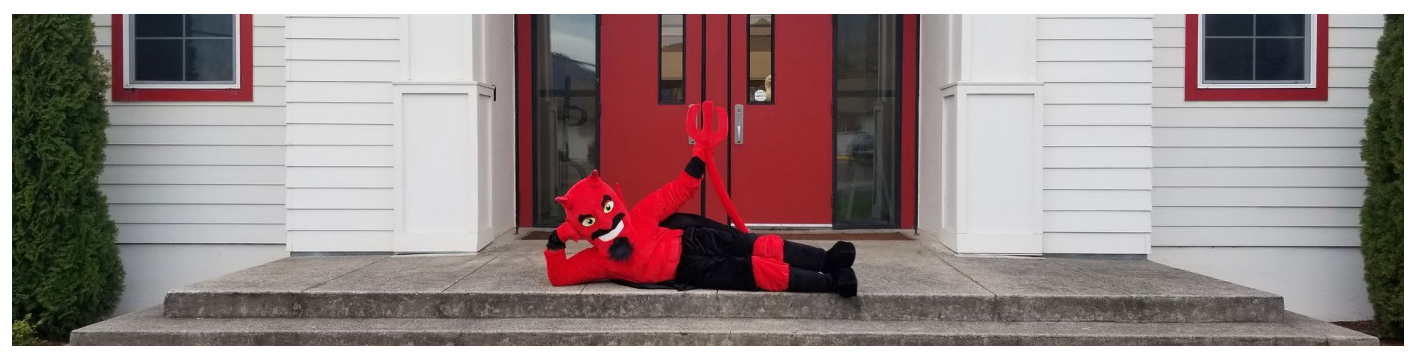
Figure 4: New Lowell Jr/Sr High School "Red Devil" mascot.