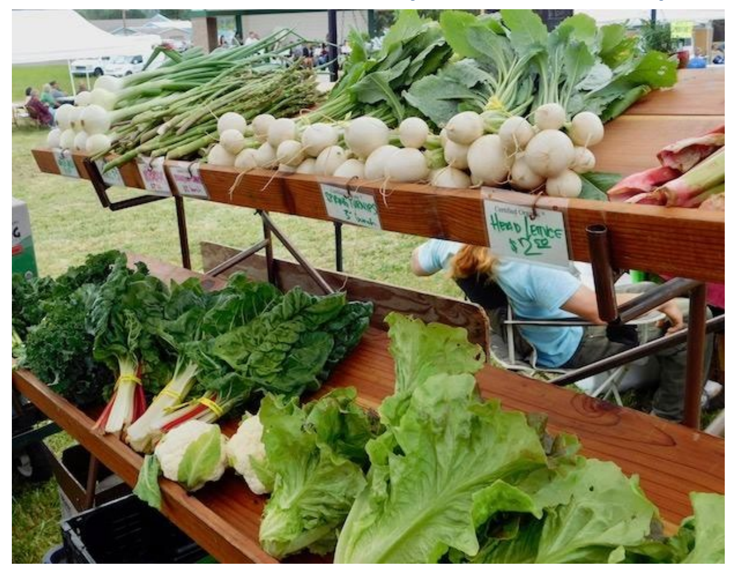
Figure 5: Dexter Lake Farmers Market in Rolling Rock Park.