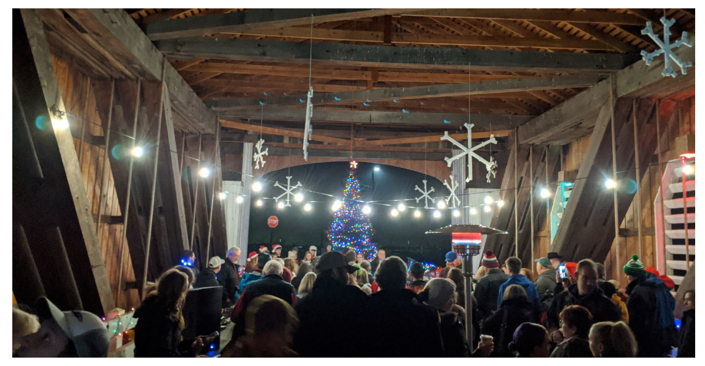
Figure 12: Lowell Covered Bridge Tree Lighting

2. Provide diverse recreation and library programming for residents of all ages and abilities.