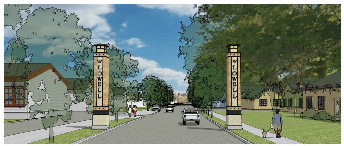
Figure 7: Conceptual rendering of a gateway into downtown Lowell on Pioneer Street.