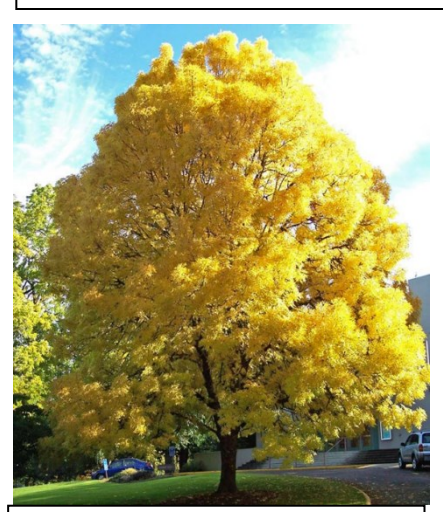
Golden Desert Ash— Fraxinus excelsior aurea Attractive colorful ornamental for landscape that grows at a medium rate. 1-3 ft per year. 20-30 ft at maturity. A stunning tree with multi-seasonal interest.