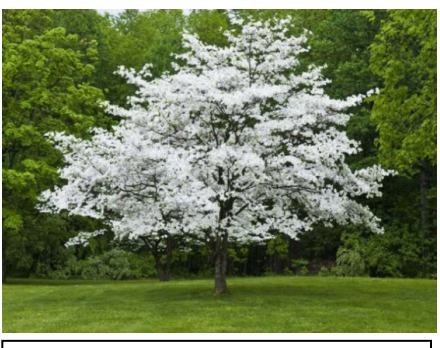
White Dogwood—Cornus florida The slowest growing of the selections, but blooms as soon as the first season after planting. 20-25 ft at maturity. Its deeply hued leaves transform to a fierce scarlet hue in the fall for month-to-month visual interest.