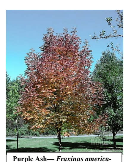
na 'Autumn Purple' Vibrant and fast growing, 2-3 ft per year. 50-70 feet at maturity. Holds its fall color longer than most.