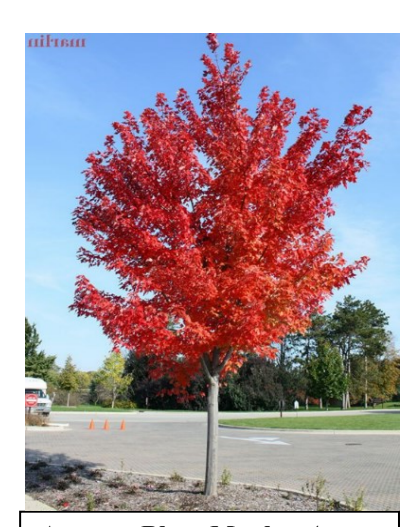
Autumn Blaze Maple –Acer x freemanii 'Jeffersred' Brightly colored and fast growing. 3-5 Ft per year to maturity at 4050 feet. Reliable red fall color with amazing hues.

We are asking for community donations to buy shade trees to offer a living and lasting memorial to a loved one or a unique and green gift for any reason. We have selected four species of trees that will in time create a lush and beautiful shade-providing memorial or gift. See pictures of the tree selections at right and below. For more information or to donate, please call City Hall at 541-937-2157.