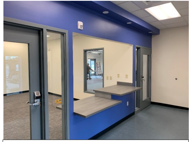
Pictured: Front counter at City Hall once you enter the front door. The door to the right goes into the library.

Construction is complete, and we're waiting on final inspections. Over the next few weeks, we will be moving city operations to the new building. The City Hall section will be open first, as we're waiting on shelving and books for the library to be delivered.