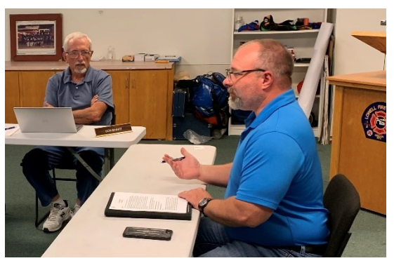
Pictured: Left, Mayor Bennett. Right, State Representative Charlie Con-

During the last legislative session, Conrad's office secured $306,420 for the City of Lowell's water treatment plant. This funding will pay for critical upgrades to the water plant, including its computer system. The current computer system has failed, and the city is using a loaned system.