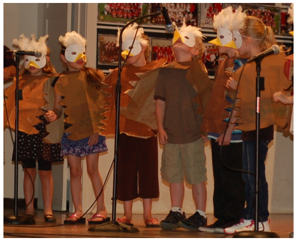
History of the Bald Eagle.