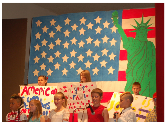
Back drop hand painted by Chantelle Wendt.

t e e r s , L u n d y Elementary presented a well done show to the comm u n i t y May 28th. Great job everyone!