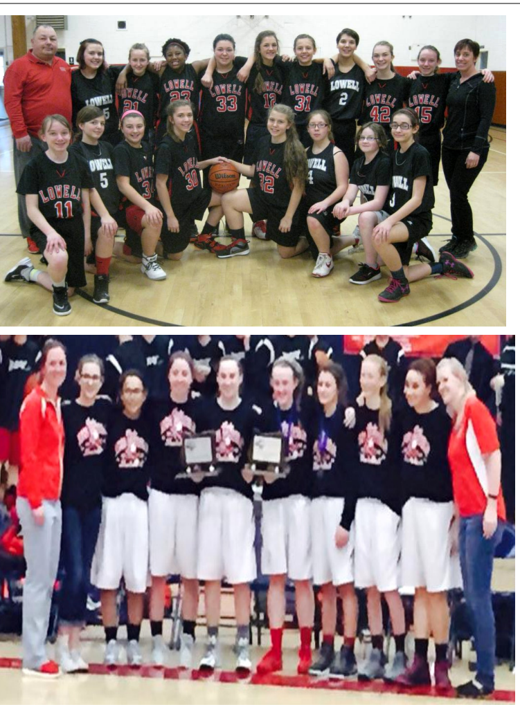
Congratulations to our basketball teams on their exciting seasons!

Finishing 10-2 in league play, the boys team got in to the playoffs and advanced to the second round with a win over Powers 57-47. The second round proved more difficult, resulting in a loss to Columbia Christian in Portland.