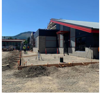
What's this?? Our new gym looking good and almost ready for Lowell students!