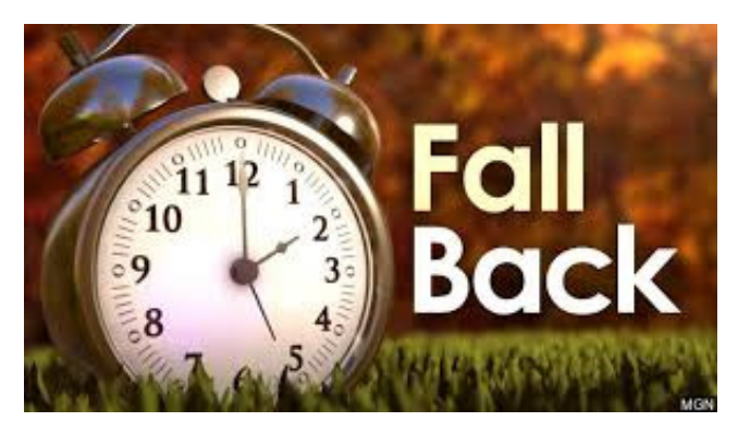
Don't forget to set your clocks back one hour the night of Saturday, October 31st!