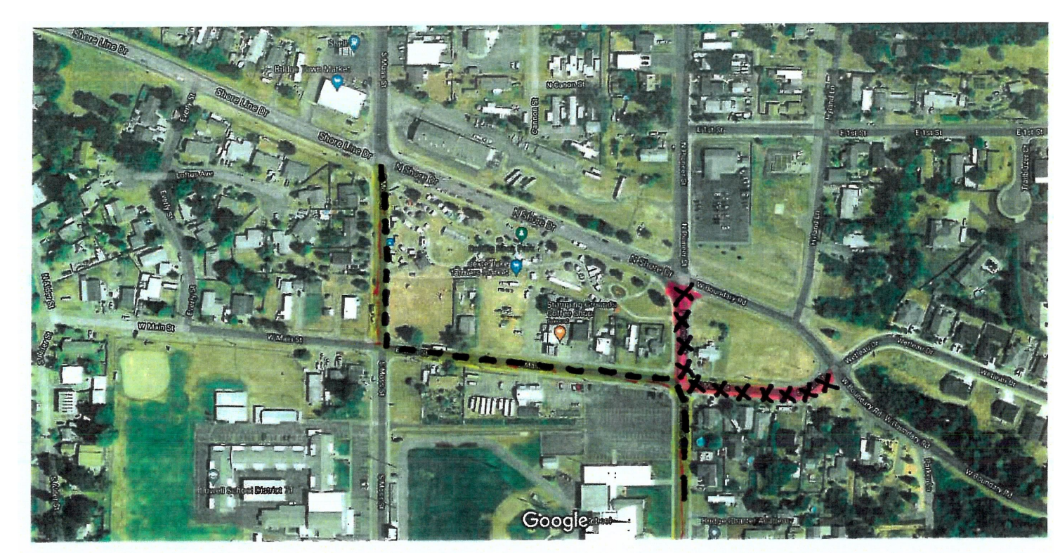
100 ft 1