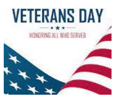
Thursday November 11th